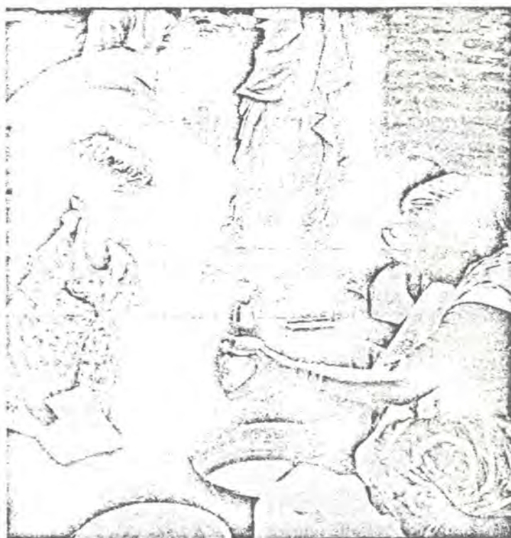
Fiscal rectitude won't feed them

What of the transfer problem after 1980? If OECD countries had to repay a $300 billion debt over six years at a real interest rate of 5 per cent—and provided (this is the all important proviso) they return to their pre-1973 economic growth rate of 5 per cent per annum from 1976 when their annual debt service would be at a maximum 1980 of 1.8 per cent of gnp and 9.2 per cent of exports. Many developing countries have an annual debt service now of 3–4 per cent of gnp, 20–25 per cent of exports.