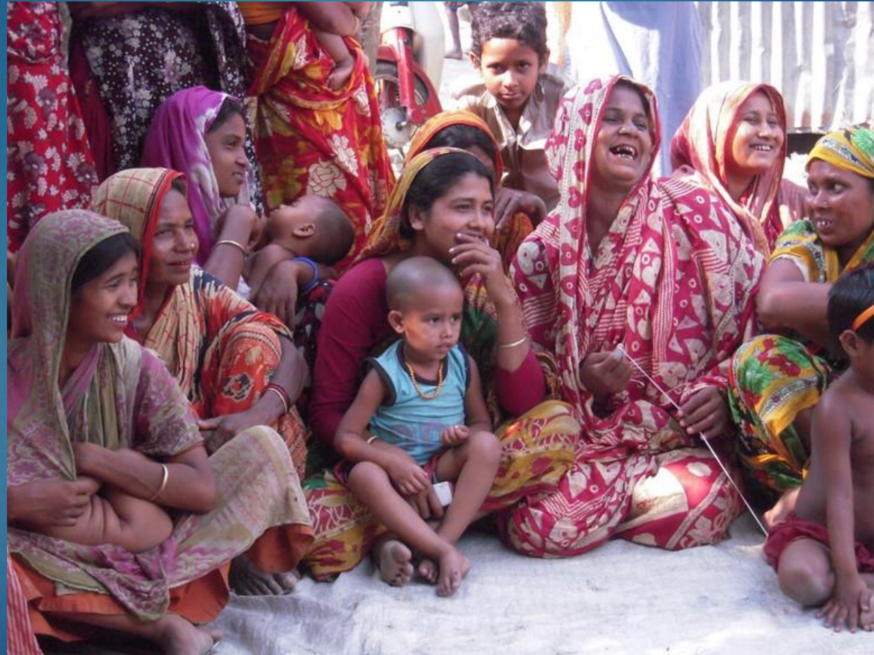
Borrowers of microfinance in Gaibandha, Bangladesh, 2011