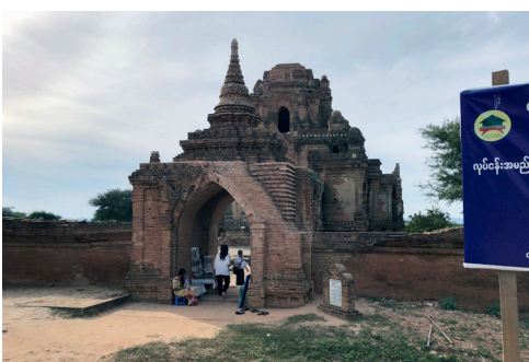
▲ Bagan Cultural Heritage Site, Myanmar

Support: GFDRR mobilized key experts to aid government in developing the Bagan DRM Plan.