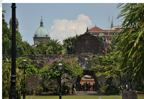
▲ Intramuros, Manila Historic Center, Philippines