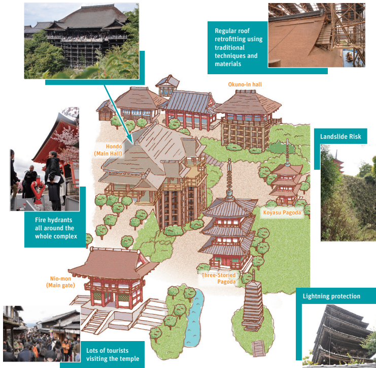
KIYOMIZU-DERA TEMPLE DISASTER PREVENTION MEASURES, THE WORLD BANK DRM HUB