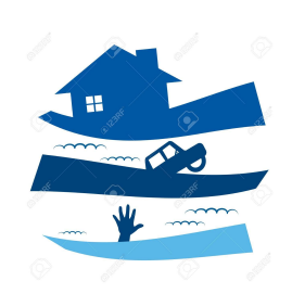
Extreme weather events