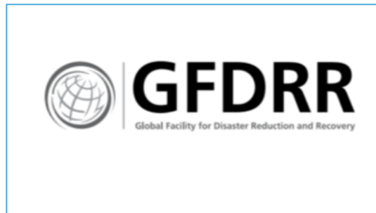
Global Facility for Disaster Reduction and Recovery