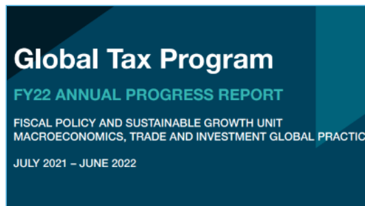
Global Tax Program