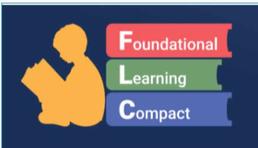
Foundational Learning Compact