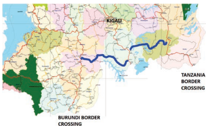
Figure 1: National Highway Network (in Red) and Intervention Sections (in Blue)

The Government of Rwanda (GoR) has assigned fundamental importance to the development of the economic infrastructure of the country, and particularly to road transportation. The construction of the Ngoma-Nyanza highway is identified as a priority investment for the government under the most recent poverty reduction strategy. As depicted in blue in Figure 1, this new highway consists of two separate segments that will replace the existing gravel road and will provide new connectivity within the National Road System between the Tanzania port of entry in the south east of the country and southern central Rwanda. The first section has a length of