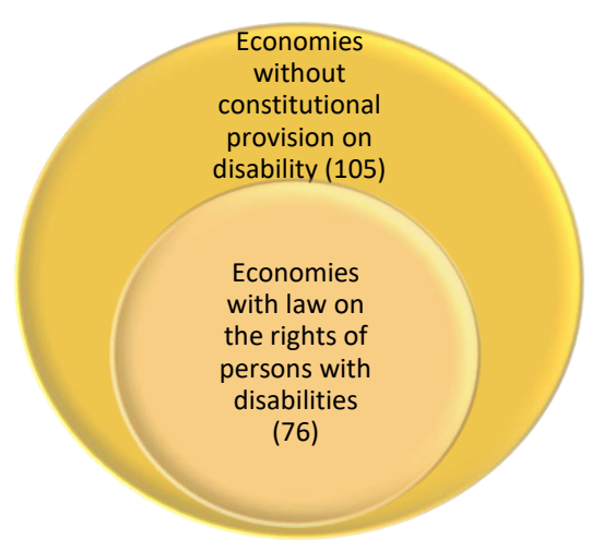
Figure 3: The enactment of a law on the rights of persons with disabilities is not necessarily preceded by a corresponding constitutional provision