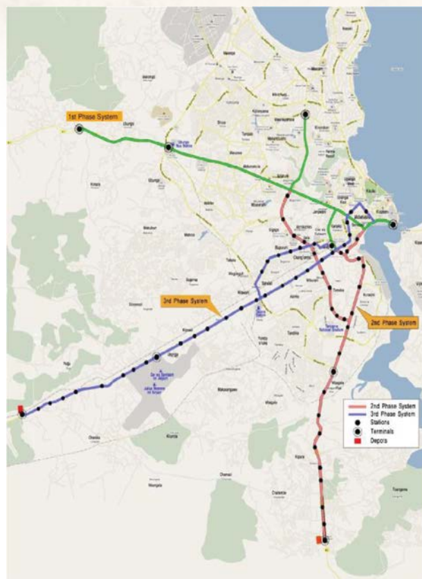
Dar es Salaam Bus Rapid Transit Map, Phases 1–3

For more information about the Tanzania Second Central Transport Corridor Project visit: http://projects.worldbank.org/P124114/tanzania-second-central-transport-corridor-project-add-financ?lang=en