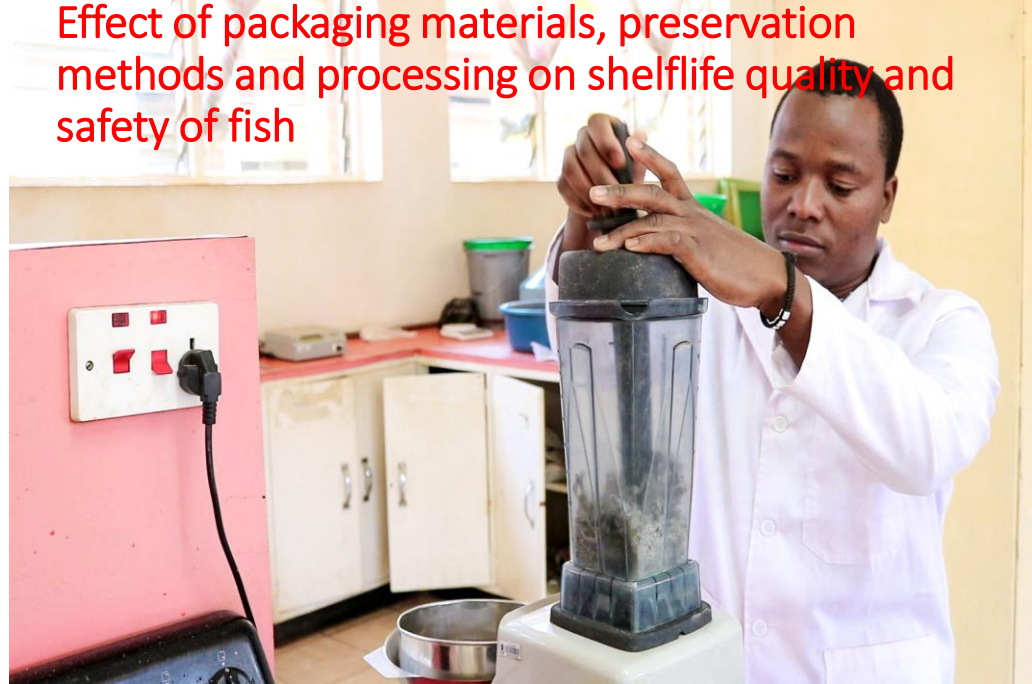
Effect of packaging materials, preservation methods and processing on shelflife quality and safety of fish