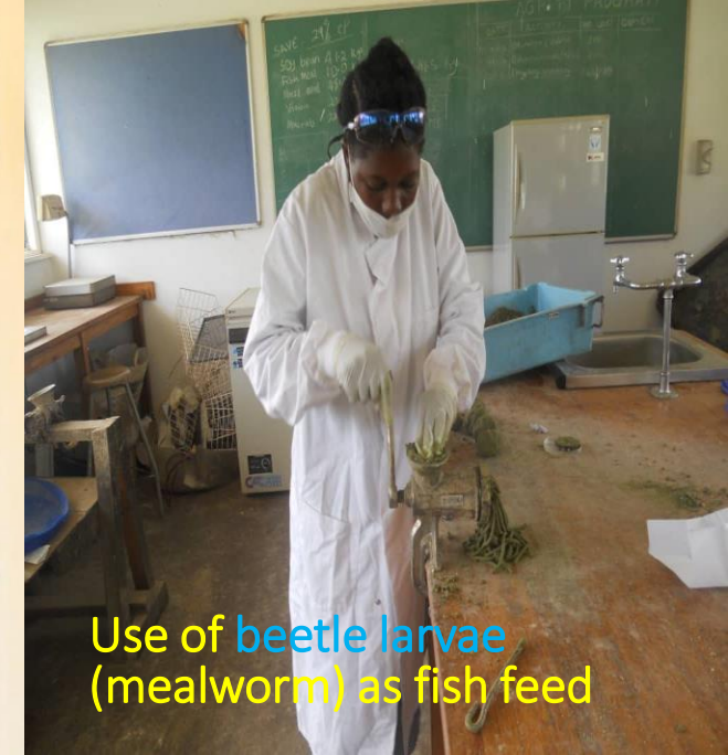
Use of beetle larvae (mealworm) as fish feed