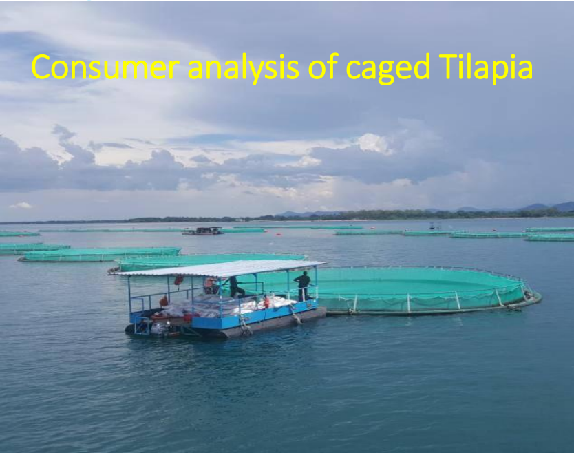
Consumer analysis of caged Tilapia