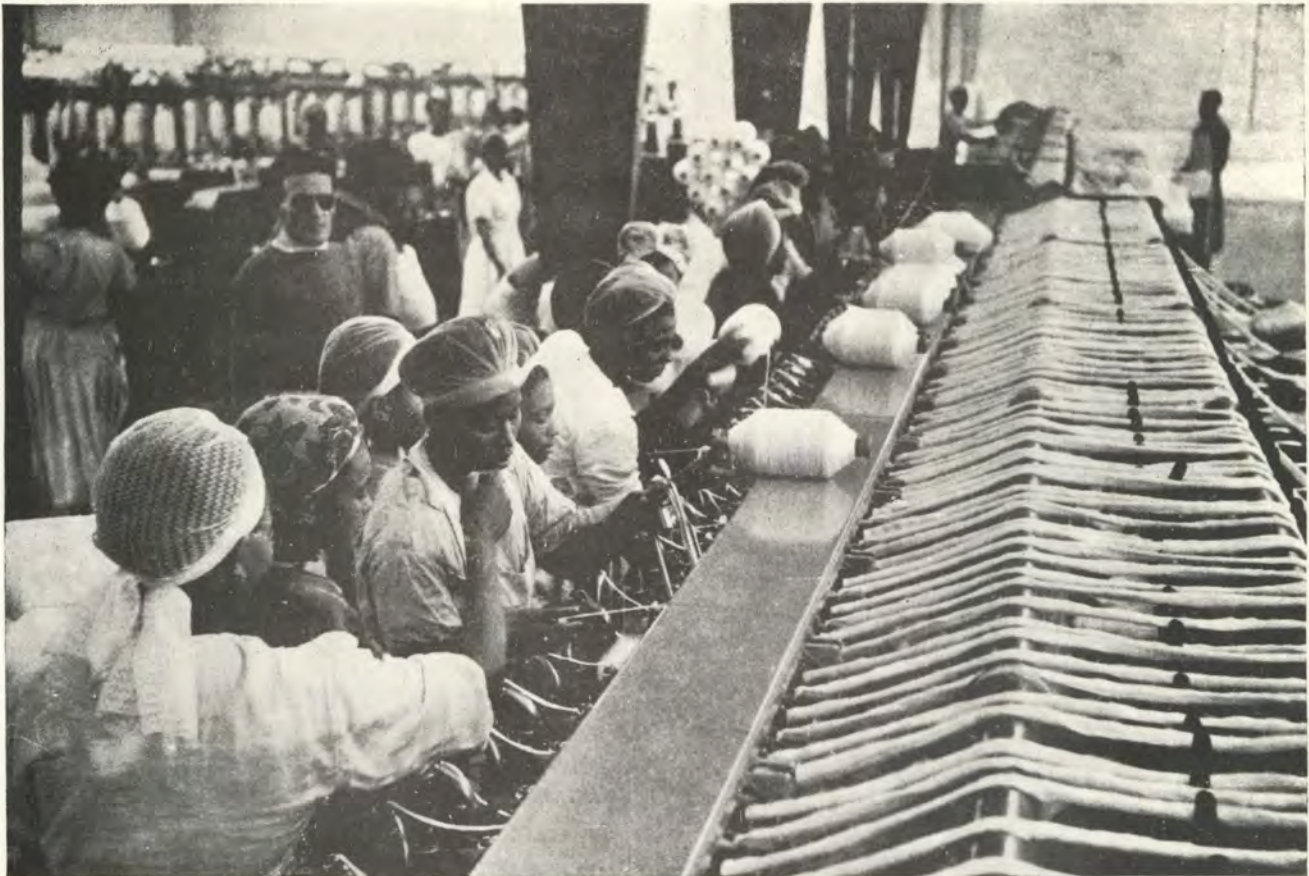
Une usine de textile à Addis-Abéba financée par la Banque Ethioienne de Développement avec un prêt de la Banque Mondiale.

catégories d'entreprises, compte tenu des besoins et des possibilités de l'investissement privé ; la politique et les mesures économiques et financières requises pour mener à bien un programme de développement. Il n'est pas question, dans leurs rapports, de dresser un plan détaillé de développement ce qui serait incompatible et impossible pour de telles missions, mais plutôt d'indiquer les objectifs susceptibles d'être atteints, de donner des directives générales pour un développement à moyen terme, d'insister sur les problèmes majeurs et la façon de les aborder pour les résoudre.