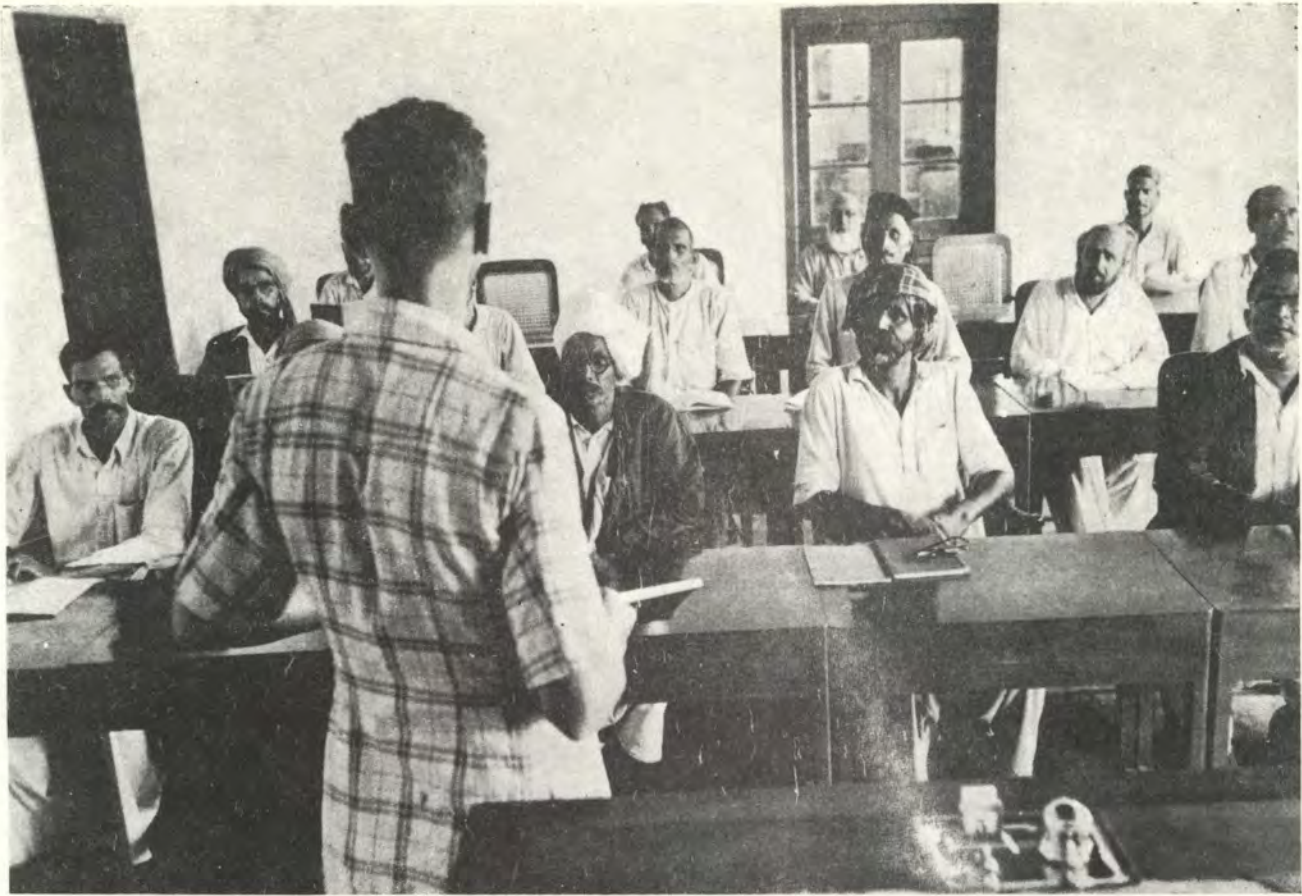
Introduction of modern Diesel locomotives has necessitated retraining the drivers for the conversion from steam to Diesel.

the salaries of outside experts, and all the costs incurred outside the country (for living expenses, travel, printing of the report, etc.), and the government meeting the other half of the experts' salaries and expenditures within the country.