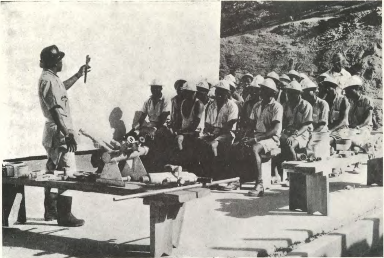
Travailleurs indigènes, au projet hydroélectrique de Kariba Gorge sur le Zambèze, recevant une instruction sur le marteau pneumatique.

domaines, ainsi que sur les facteurs sociaux, pédagogiques, juridiques, constitutionnels ou autres éléments susceptibles d'affecter ce potentiel. Cela demande aussi un examen averti des objectifs à atteindre et des solutions possibles ; il faut aussi étudier le rapport existant entre une grande diversité de projets et autres sources de dépenses, et les priorités à leur accorder ; il faut encore examiner avec soin les risques éventuels d'inflation et les difficultés de la balance des paiements et les moyens de les prévenir ; cela implique enfin des options politiquement délicates parmi une multitude d'intentions et d'intérêts opposés. Si l'on considère que les nations les plus évoluées éprouvent de grandes difficultés pour surmonter de tels problèmes, on comprendra combien la tâche d'établir un programme de développement peut être décourageante mais indispensable pour ceux qui accèdent à la civilisation ou qui accomplissent leurs premiers pas dans le développement économique.