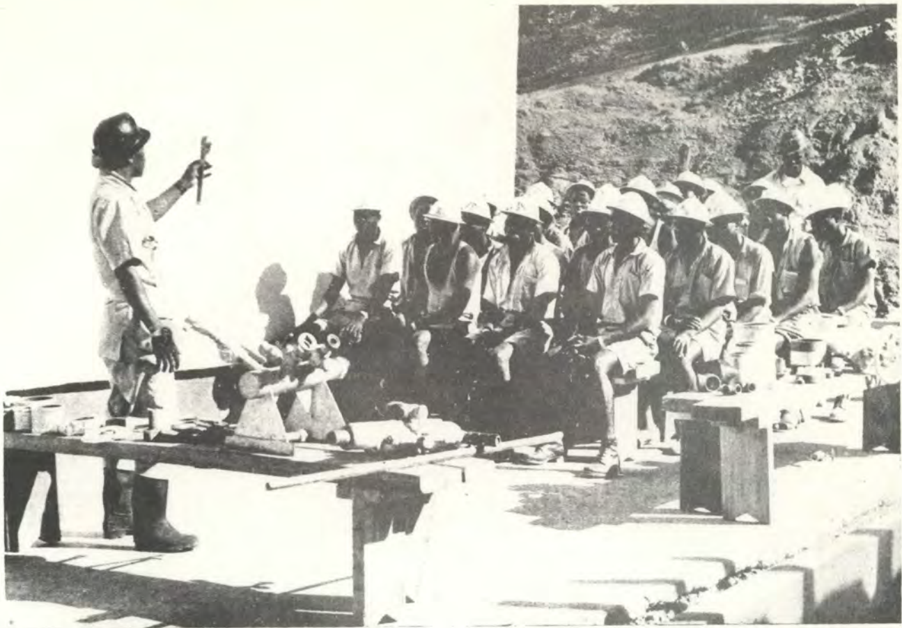
At Kariba Gorge hydroelectric project labourers are instructed in the operation of pneumatic drills.

limited resources is a difficult, highly complex one at best. It calls for extensive technical and economic studies of the country's development potential in various fields, and of the social, educational, legal, institutional and other factors that affect this potential; for a rather sophisticated consideration of policy objectives and alternatives; for analyses of the interrelation and priority of a wide variety of projects and other objects of expenditure; for a judicious appraisal of possible inflationary and balance of payments difficulties, and ways of meeting them; and for politically difficult choices among a host of competing purposes and interests. Even the most advanced nations find it hard to deal with such issues; to countries newly emerging or in the early stages of economic development, the task of development programming is likely to be as dismaying as it is essential.