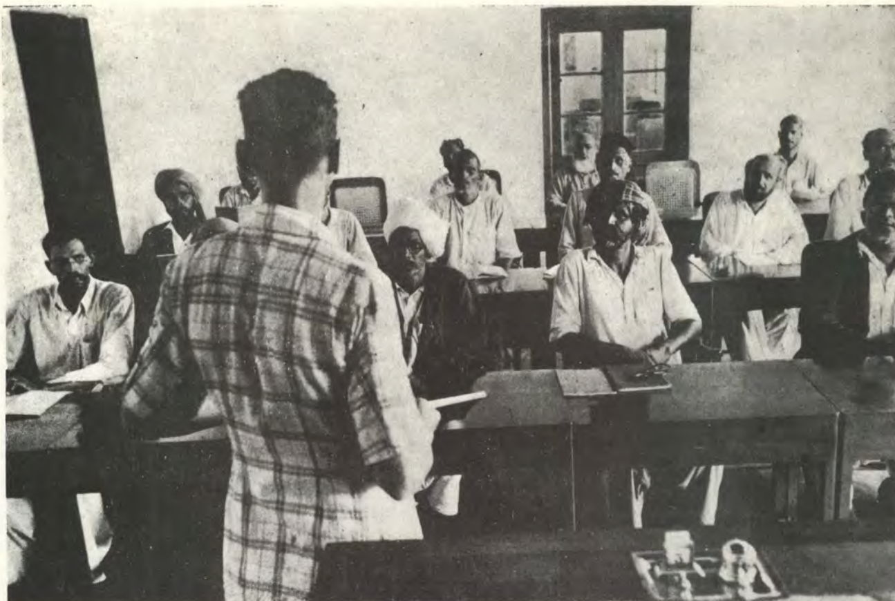
L'introduction de locomotives Diesel modernes au Pakistan a nécessité une nouvelle formation des conducteurs en raison du passage de la vapeur au Diesel.

Les travaux de la mission ne sont pas destinés uniquement aux techniciens, mais aussi à tous les membres intéressés de la communauté. Des dispositions sont prises pour qu'ils soient publiés dans la langue locale, en anglais, et leur diffusion est particulièrement encouragée.