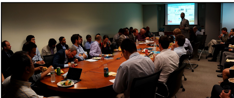
2011 PPPs: The nuts and bolts, Washington, DC (May 15, 2014)

The World Bank Poverty and Inequality Measurement and Analysis Practice Group organized a seminar entitled "2011 PPPs: The nuts and bolts" on May 15, 2014. The seminar discussed the methodology and processes underlying the calculation of the 2011 PPPs. The recorded presentation and discussions are posted on the Practice Group website: http://spapps.worldbank.org/apps/Poverty/PI-MAPG/default.aspx