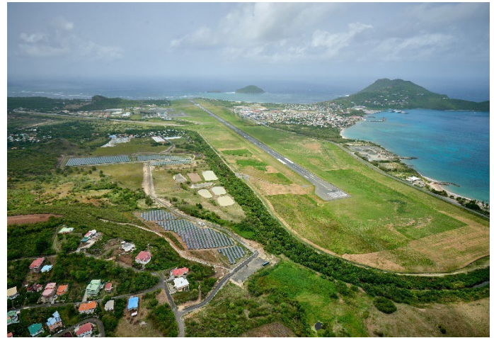
Photo credit: St. Lucia Electricity Services Limited (LUCELEC) 3MW Solar Farm, La Tourney, Vieux-Fort, Saint Lucia

The World Bank Group structured a $235 million Caribbean Resilient Renewable Energy Infrastructure Investment Facility (RREIIF) together with the Eastern Caribbean Central Bank (ECCB) to accelerate resilient renewable energy development through economies of scale, risk mitigation, and investments in resilient grid infrastructure.