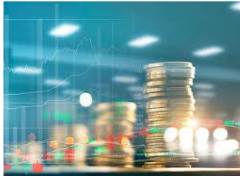
EXTENDED PRODUCER RESPONSIBILITY