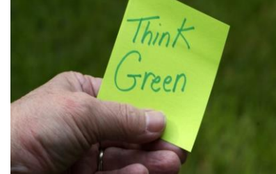
CULTURAL SHIFT – CONSUMER AWARENESS