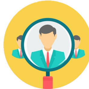
Human Resource Development (HRD)