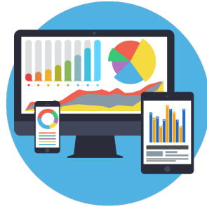
ASEAN Vaccine Information Sharing