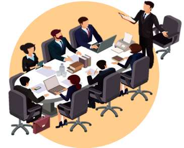
ASEAN Vaccine Network (AVN)