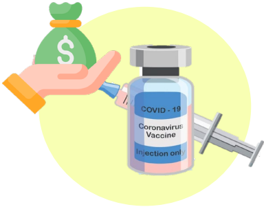
ASEAN Pool Procurement and Stockpiling System