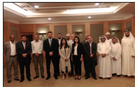
Sub-national PPP workshop, September 14-17, 2015, Abu Dhabi, UAE

Moreover, a sub-national PPP workshop took place in Abu Dhabi, United Arab Emirates on September 14-17, 2015 to monitor progress, finalize methodologies, provide training on the ICP tools, and set the future timeline for the regular production of sub-national PPPs in the United Arab Emirates. The final PPP results at the Emirate level are expected to be produced and released by the end of March 2016.