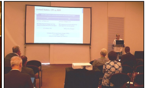
60 th ISI World Statistics Congress, July 30, 2015, Rio de Janeiro, Brazil