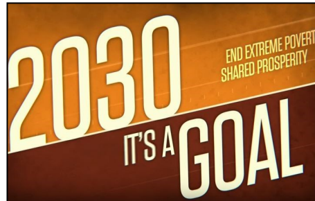
Still from the World Bank's "One Generation, Two Goals, 60 Seconds" video

The African Development Bank organized two additional sessions on "Measuring Economies using the ICP data: Regional perspectives" and "Purchasing Power Parity Concepts and Methodology: A Multifarious Outlook." China organized the fourth session entitled "Improving the ICP methodology in emerging economies," which marked the first time a country organized a session on the ICP in this forum. More information available online .