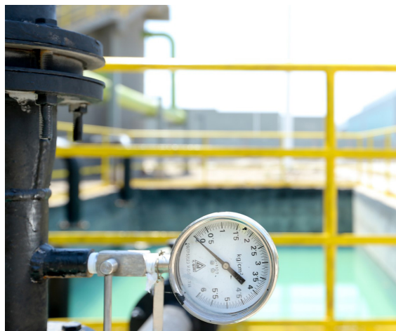
Modern ZLD (Zero liquid discharge) facility at HIP