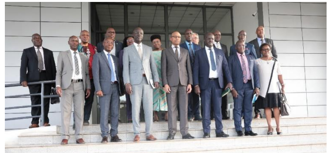
The Executive Director with the Bankers' Association and the Federal Chamber of Commerce and Industry Representatives