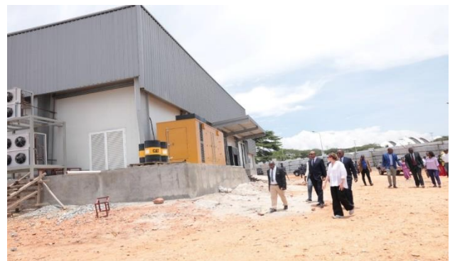
The ED visits the project financed by the World Bank Group: construction of a warehouse for the conservation of perishable products under controlled temperature at the international Airport of Bujumbura