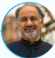
Indermit Gill , World Bank Chief Economist, speaking at the 2025 LEADS Workshop in Togo