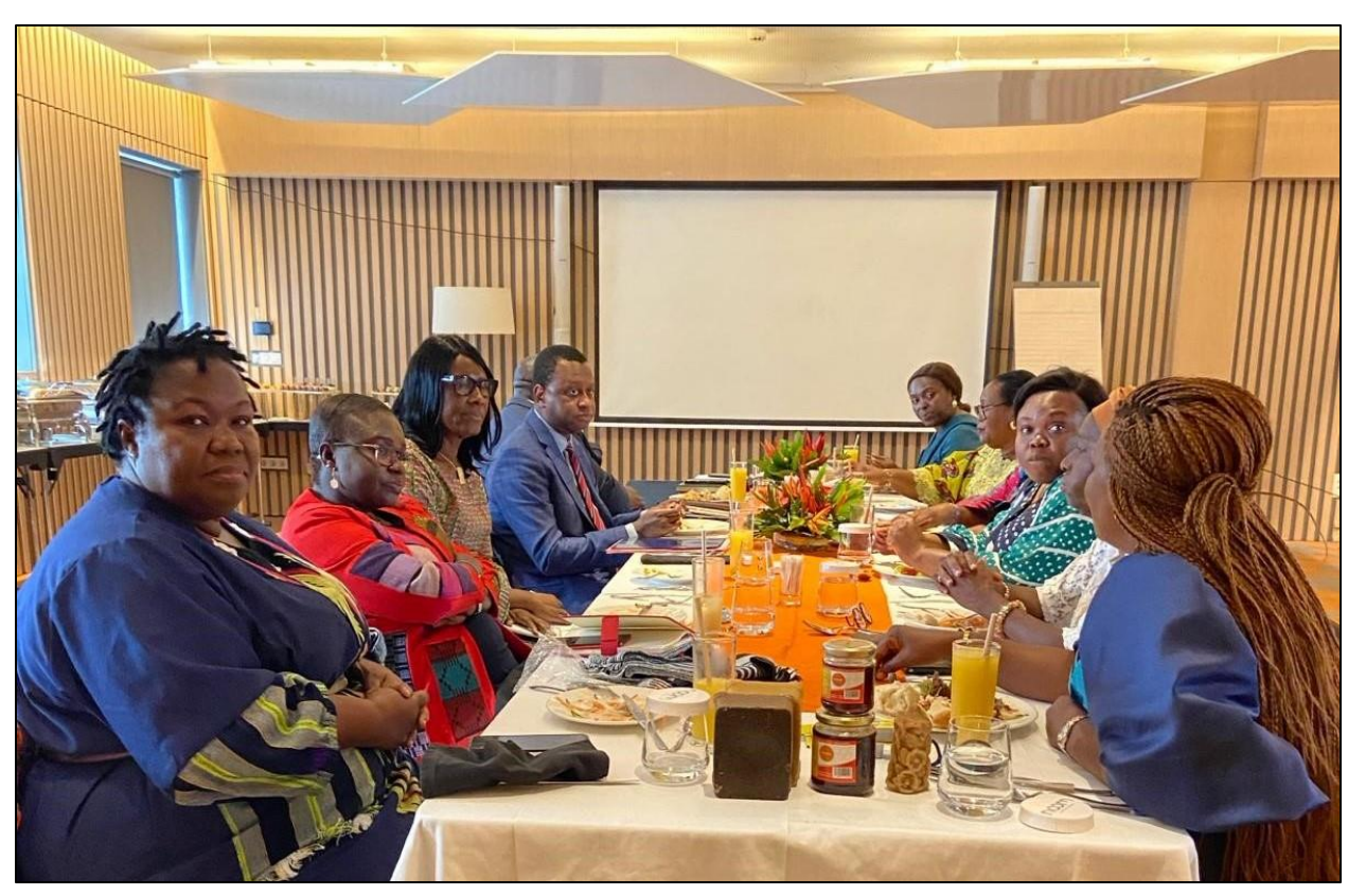
Exchange of views over lunch between the Executive Director and women entrepreneurs in Abidjan.

The Executive Director was very pleased to take part in a luncheon discussion on February 5 with a group of women entrepreneurs in the agri-food and textile sectors. These dynamic women particularly impressed him with their expertise, positive influence and remarkable entrepreneurial achievements. During their frank discussions, the women entrepreneurs shared their ideas and experiences, and special emphasis was placed on their main challenges and opportunities. These discussions are to be pursued to contribute to the development of local female entrepreneurship in Côte d'Ivoire.