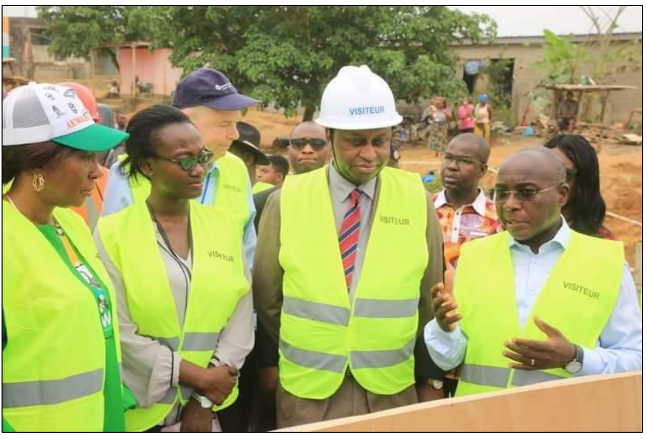
Visit to the area of the Urban Sanitation and Resilience Project (PARU) with the Minister of Hydraulics, Sanitation and Hygiene, Mr. Bouake Fofana (in the photo on the right), and the Mayor of Abobo and President of the Senate, Ms. Kandia Camara (in the photo on the left).

mobilization; prevention; and the supervision of public enterprises, their financial viability and valuation, and the securing of property titles.