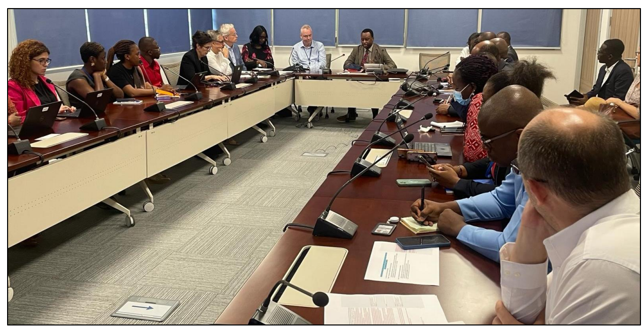
Exchange with the WBG staff living in Abidjan.

On February 6, the Executive Director and resident staff of the World Bank (WB) and the International Finance Corporation (IFC) in Abidjan discussed a range of topics, including the functioning of WB, operations in general, ongoing reforms within the institution, the role of the Board of Directors and staff-related issues.