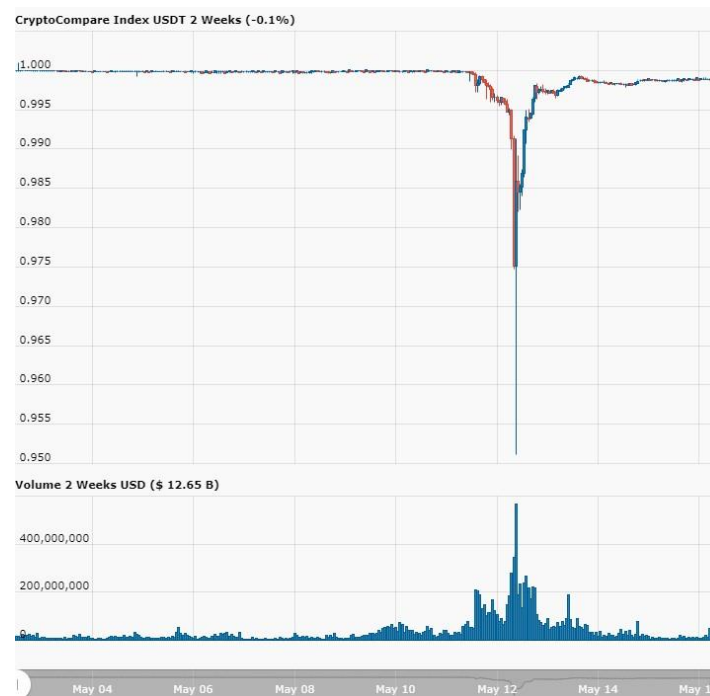
Figure 1: $ price of Tether and Terra, May 2-16 2022