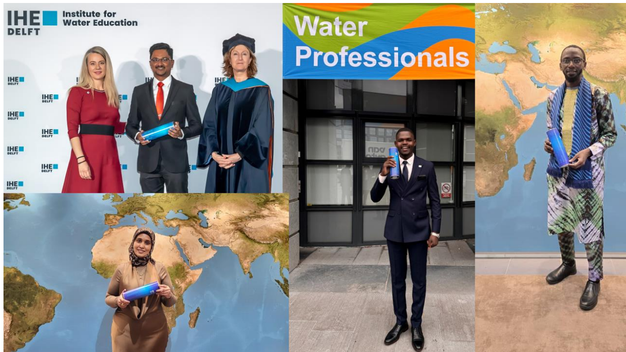
Graduation ceremony for 2023 JJ/WBGSP scholars at IHE Delft Institute for Water Education October 2024

Japan has partnered with the World Bank in support of this development objective over the years, including through two programs administered under the Japan-funded and World Bank-administered Policy and Human Resources Development Fund (PHRD): (i) the Japan Indonesia Presidential Scholarship Program (JIPS), which closed in 2010 and (ii) the Joint Japan/World Bank Graduate Scholarship Program (JJ/WBGSP), which remains active.