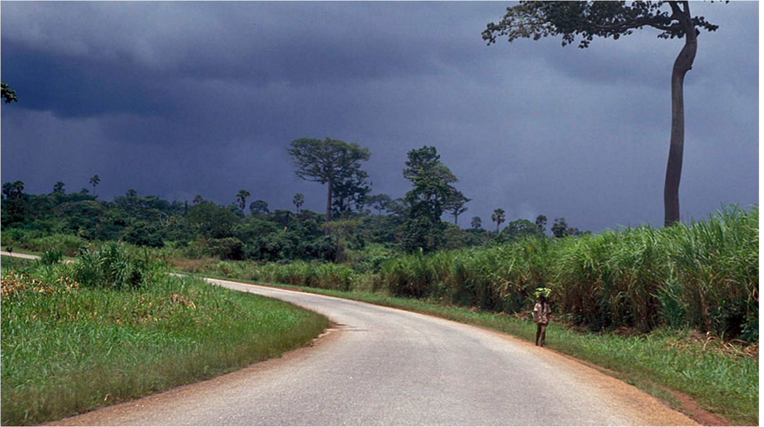
View of road before storm. Ghana.