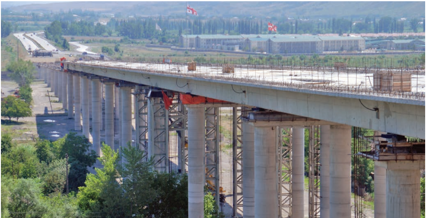
The Liakhvi bridge on the East-West Highway, built with the latest construction technology.

roads were in fair or good condition, but 60 percent of secondary and most local roads remained poor. Traffic injury and fatality rates were the worst in Europe.