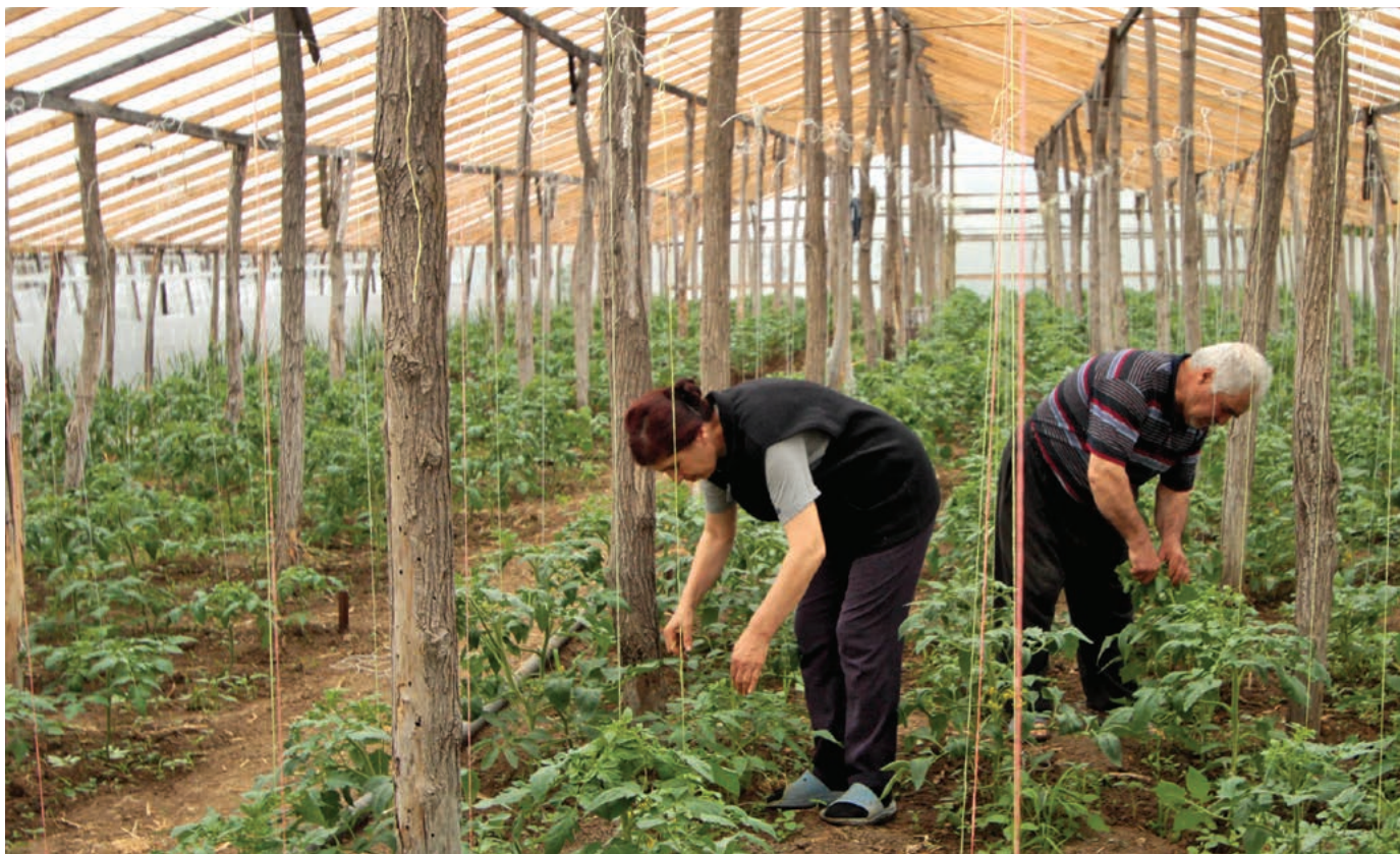
Enhancing market access, improving the logistics infrastructure, and expanding productivity and export growth will require improving skills and worker deployment, which in turn will help generate employment and lead to more inclusive growth in Georgia.

business environment and land prices are favorable. Agricultural exports are worth about $700 million a year.