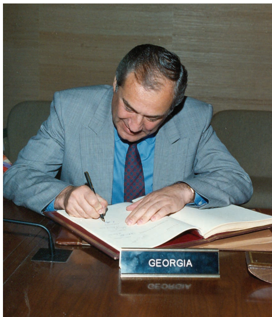
Zurab Chkheidze, Ambassador Extraordinary and Plenipotentiary of Georgia to the United States, signing the membership agreement (August 1993).

its 2020 vision of rapid, efficient economic growth and job creation. Inclusive growth and prosperity will reach every member of society. And the rational use of natural resources will promote environmental safety and sustainability and resilience to natural disasters.