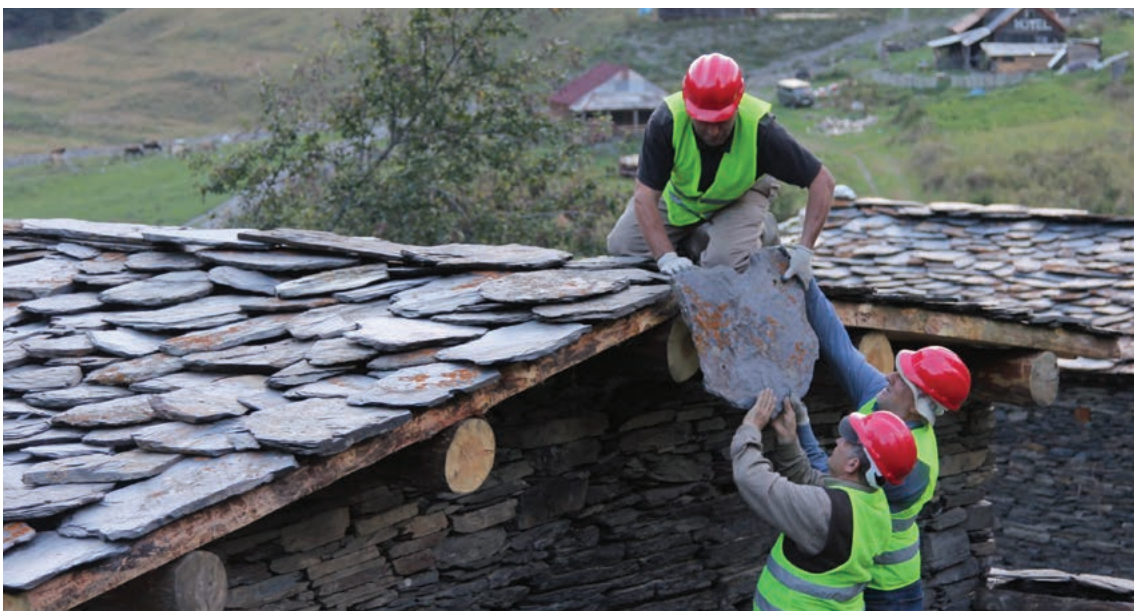
Above: Rehabilitation works under way in the high, mountainous village of Dartlo in the Kakheti region, under the First Regional Development Project.

Georgians have faced high out-of-pocket expenses for health care since independence. The government introduced Universal Health Coverage (UHC) in 2013 and places high priority on delivering effective, sustainable services adapted to the country's changing demographics, difficult since an older population increases the costs of health and other social programs.