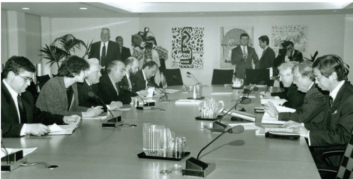
Georgia–IDA membership signing ceremony, Washington, DC (August 1993).

Georgia is now a middle-income country, with steady economic growth and a per capita GDP of $3,833 in 2015. Inclusive policies are reducing poverty, from 55 percent in 2001 to about 21 percent in 2015. Georgians have rebuilt the country with strong institutions and are working toward realizing