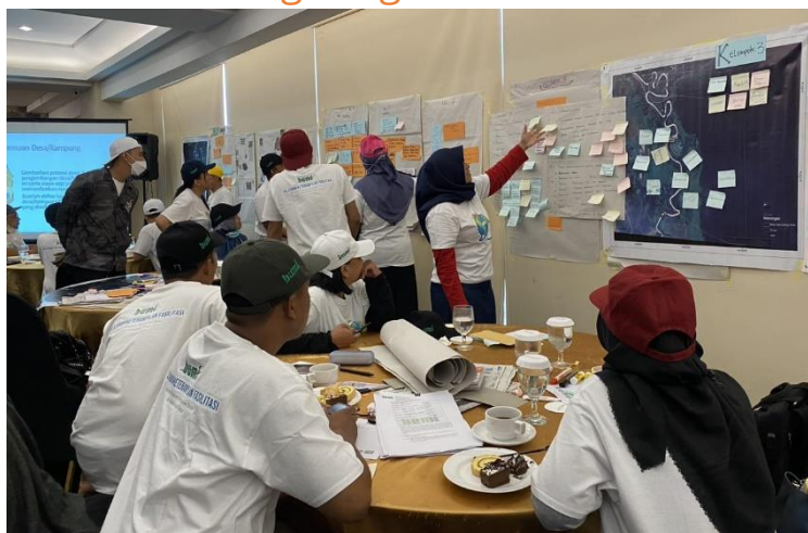
Workshop attendees identify necessary skills for community facilitation.

A three-day training program was recently concluded by NGO Bumi in the East Kalimantan Province's capital, Samarinda. The training was organized as part of a series of capacity building activities under EnABLE Phase 1. The objective of these capacity building activities is to equip community facilitators and government staff with inclusive facilitation skills prior to their deployment to the ten pilot villages. 45 village facilitators and government staff participated in the program and practiced various