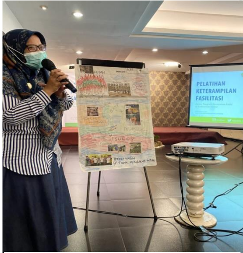
A workshop participant presenting group work.

tools and engagement approaches with vulnerable groups, as well as deepened their understanding of the Emissions Reduction Program (ERP) and its Benefit Sharing Plan (BSP).