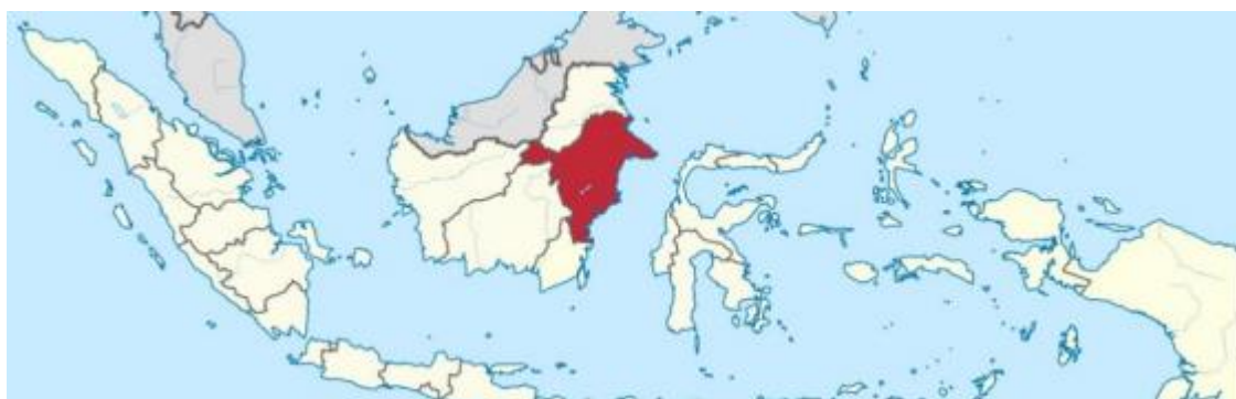
Emission Reduction Program Area East Kalimantan, Indonesia.

The EnABLE program will support its beneficiaries in enhancing their access to the carbon and non-carbon benefits as laid out in the emission reductions program's Benefit Sharing Plan . Specific opportunities and benefits are described in this document. The EnABLE program will work to ensure communities are informed about the emission reductions program, are aware of the benefits available under the program, and support them in developing viable proposals for community benefits to flow from the program. As a result, it is expected that marginalized communities and community groups will develop and submit viable investment proposals for financing under the BSP on sustainable, low-carbon livelihoods with a special focus on gender inclusion and recognition of the role of local and traditional knowledge in promoting livelihoods.