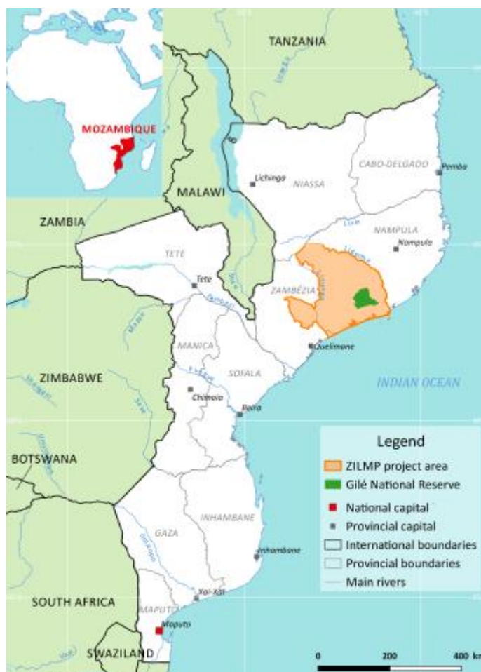
Emission Reduction Program Area Zambézia, Mozambique.

The EnABLE Country program augments the ZILMP and aims to maximize the carbon and non-carbon benefits of EnABLE beneficiaries in the jurisdiction. The program will raise awareness and develop capacity among vulnerable groups, particularly women and youth, on the ZILMP and related BSP. Furthermore, the program will provide technical support to community-based organizations to develop viable investment proposals and/or communal initiative plans, particularly with regards to climate smart agricultural practices and alternative livelihoods. The program is likely to focus on the districts within the Zambézia province that have the highest emissions in the landscape: Mocuba, Alto Molócué and Gilé.