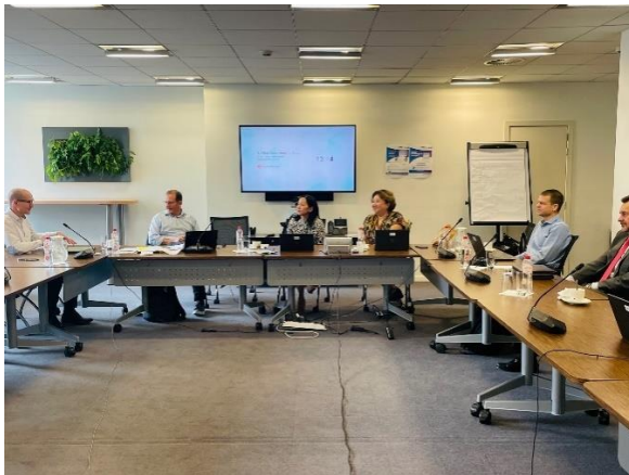
SC members discussing a country proposal.

The EnABLE team also presented an update on the status of the program to FCPF Carbon Fund Participants and observers on September 15 and made a pitch to potential donors at the SCALE meeting on September 16, 2022.