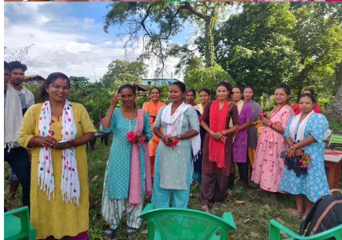
Top: Meeting attendees study the Community Starter Kit booklet. Bottom: Participants of community meeting.