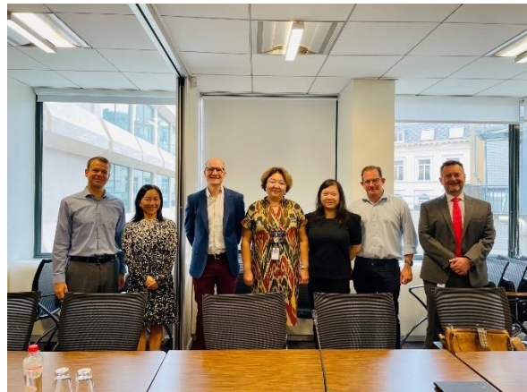
The 5 th SC meeting was the first to take place in person.