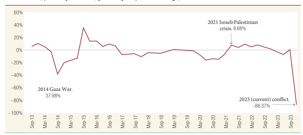
FIGURE 1 • Gaza Real GDP Growth (quarterly real GDP, year-on-year percent change)