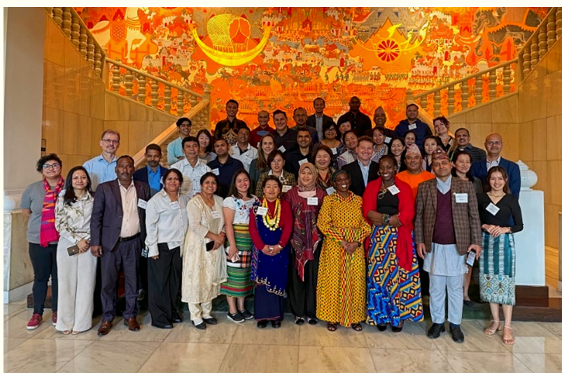
Participants of the Fundamentals of Project Management training course in Bangkok, Thailand

There was a total of 34 participants from six organizations: ANSAB (Nepal), RECOFTC (Lao PDR and Thailand), FECOFUN (Nepal), NEFIN (Nepal), KEMITRAAN (Indonesia), and RDN (Nepal). These are all organizations that are expected to engage in EnABLE country programs in the coming year. Among the facilitators and participants were representatives of intermediary organizations of the Forest Carbon Partnership Facility (FCPF) Capacity Building Program (CBP) , such as MPIDO, ACICAFOC, ANSAB, FECOFUN, Tebtebba and NEFIN.