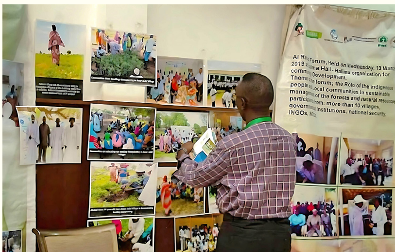
Participants of the Africa regional workshop

Attendees of the workshop reviewed and presented the main deliverables of the FCPF-CBP. Deliverables included several county-level knowledge products in Sudan, Uganda, Ethiopia, Nigeria, and Liberia for knowledge dissemination in the form of workshops, trainings, and radio broadcasts. In 2022, the CBP organized a three-month online training program that covered the topics of financial management, human rights and REDD+, gender mainstreaming, knowledge management and communication, resource mobilization, and networking. 176 participants from 7 countries (Ethiopia, Ghana, Kenya, Liberia, Nigeria, Sudan, and Uganda) completed the training, of which 48% were women.