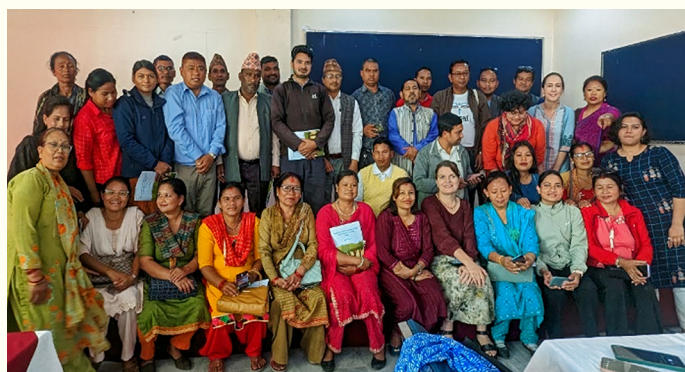
EnABLE Design Consultation Workshop in Kailali, Sudurpaschim Province.