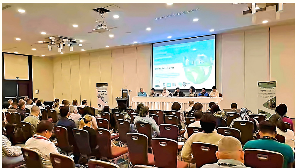
A local TV station reported on the workshop.

Key results from the CBP in LAC for IPLCs and in-country CSOs during the Phase III project included increased knowledge and understanding of REDD+ and its processes at the local level. This was accomplished through trainings and the dissemination of information at the grassroots level. The project also emphasized the involvement of women in decision-making processes, the representation of IPLCs and Afro-descendants in authoritative REDD+ bodies at the national and sub-national levels, and the development of partnerships among REDD+ stakeholders.