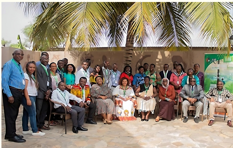
Participants of the Africa regional workshop

With the FCPF readiness grant ending in 2022, a closing workshop for FCPF-CBP African projects was held in Accra, Ghana. The workshop was attended by 37 participants from IP organizations and CSOs from 10 countries (Democratic Republic of Congo, Ethiopia, Ghana, Kenya, Liberia, Madagascar, Mozambique, Nigeria, Sudan, and Uganda). The objectives of the workshop were to review the CBP project from inception to closing and how IPLCs have interacted with it, share experiences on CBP by sub-grantees with challenges, opportunities, and lessons learned.