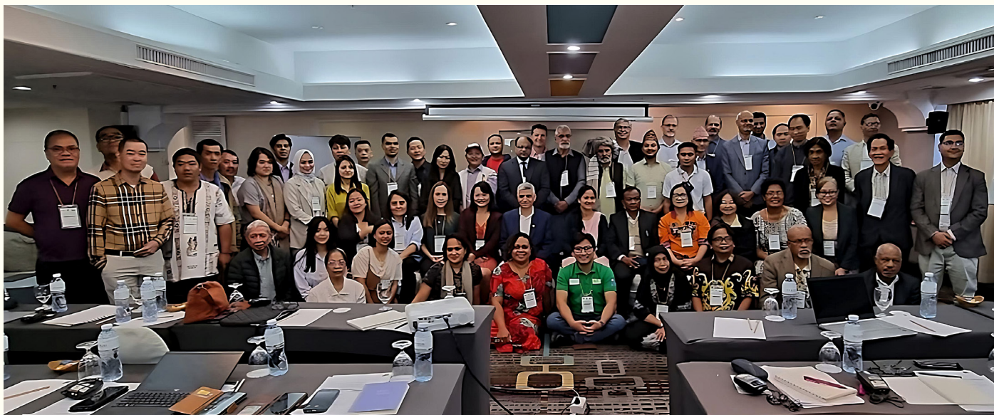
Participants of the Asia-Pacific Knowledge-Sharing workshop

Furthermore, the program conducted two important strands of research – one related to Indigenous Women and Benefit Sharing in ERP Implementation in Fiji, Indonesia, and Nepal, and another one to overview REDD+ and Benefit Sharing Programs in Asia-Pacific covering mainly Fiji, Indonesia, Laos, Nepal, and Vietnam.