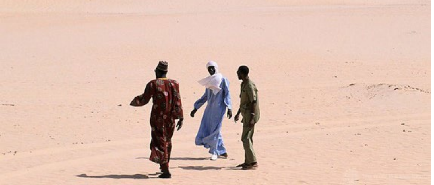
Walking through desert, Nigeria.