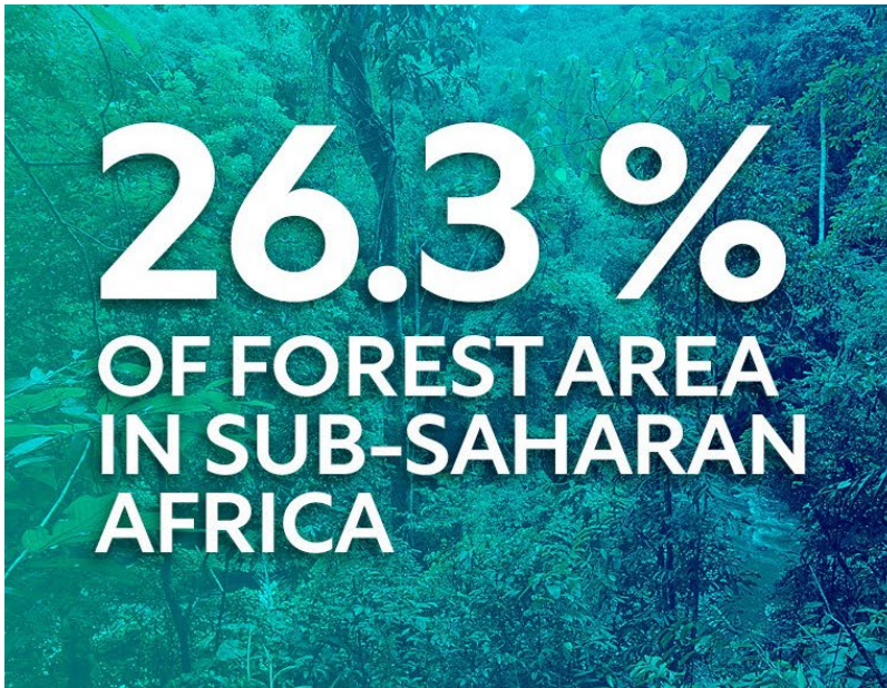
Surface forestière (% du territoire) - Sub-Saharan Africa (excluding high income)

fichiers électroniques et site Web de l'Organisation des Nations Unies pour l'alimentation et l'agriculture.