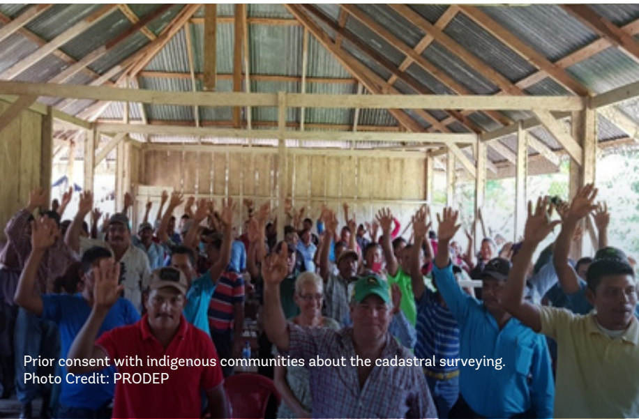
Prior consent with indigenous communities about the cadastral surveying.