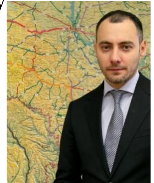
Minister of Infrastructure Oleksandr Kubrakov: Architect of national community development