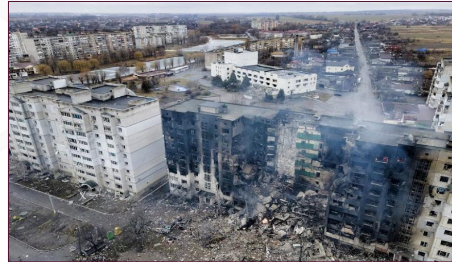
Hostumel, Ukraine 20 miles northwest of Kyiv World Bank HQ to Rockville Metro Kiss & Rise