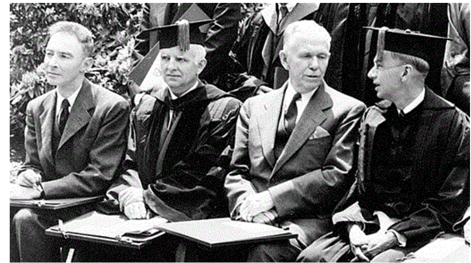
Launch of the Marshall Plan: Harvard Commencement, 1947