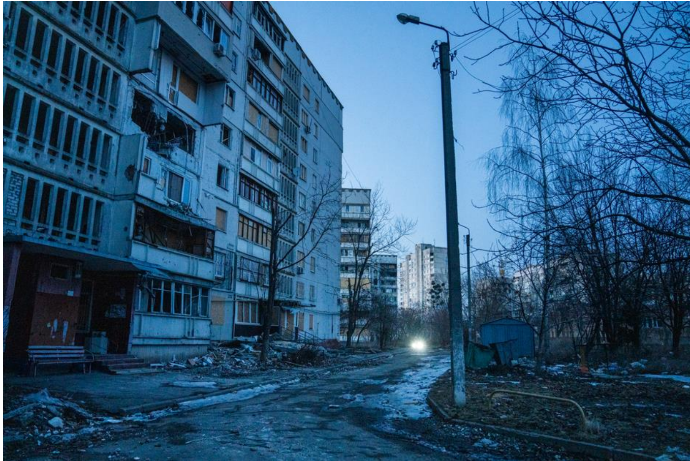
Northern Saltivka, just outside Kharkiv

Not just relief, not just recovery, a foundation of national reinvention