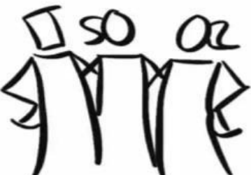
↑ EARLY MAJORITY