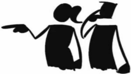
↑ EARLY ADOPTERS