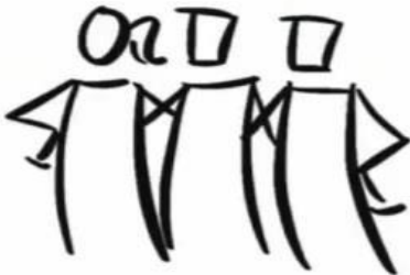
↑ LATE MAJORITY